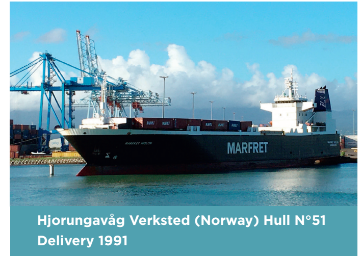
Hjorungavåg Verksted (Norway) Hull N°51 Delivery 1991