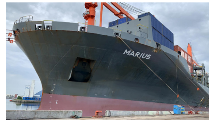
AVIC Weihai Shipyard, China Delivery April. 2018